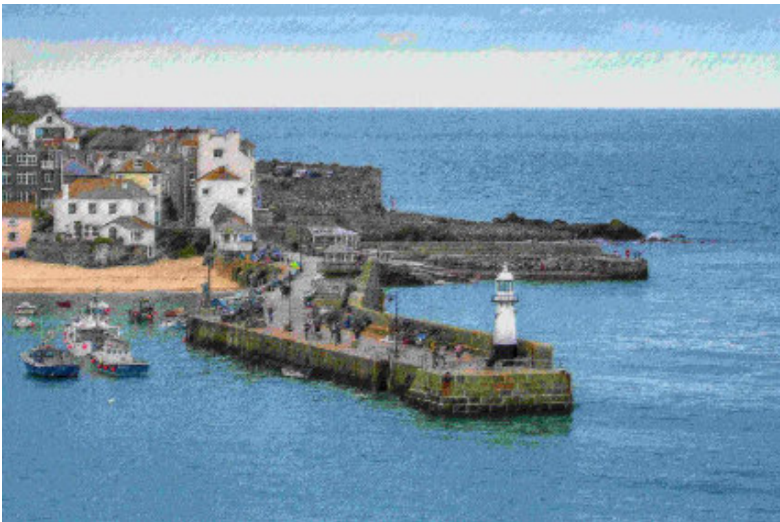
10 The Harbour at St Ives which is still a busy port for sailors and fishermen alike