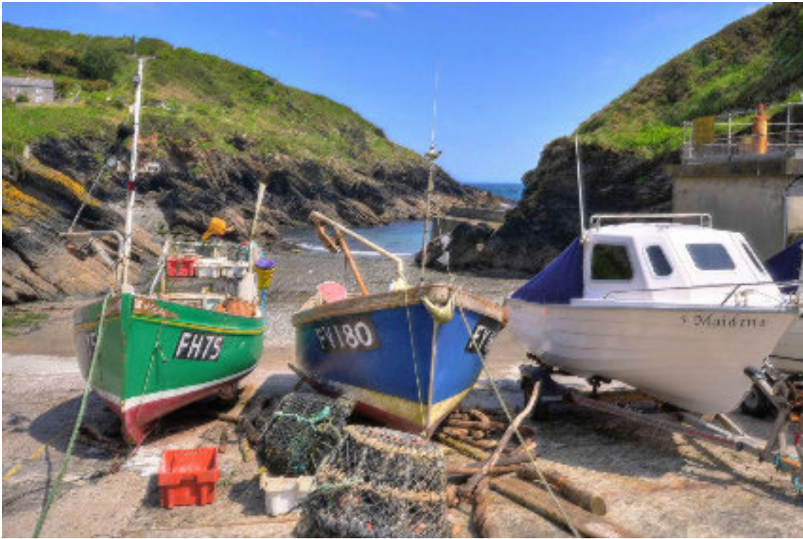
9 A pair of small fishing boats and a cruiser pulled up at Portloe