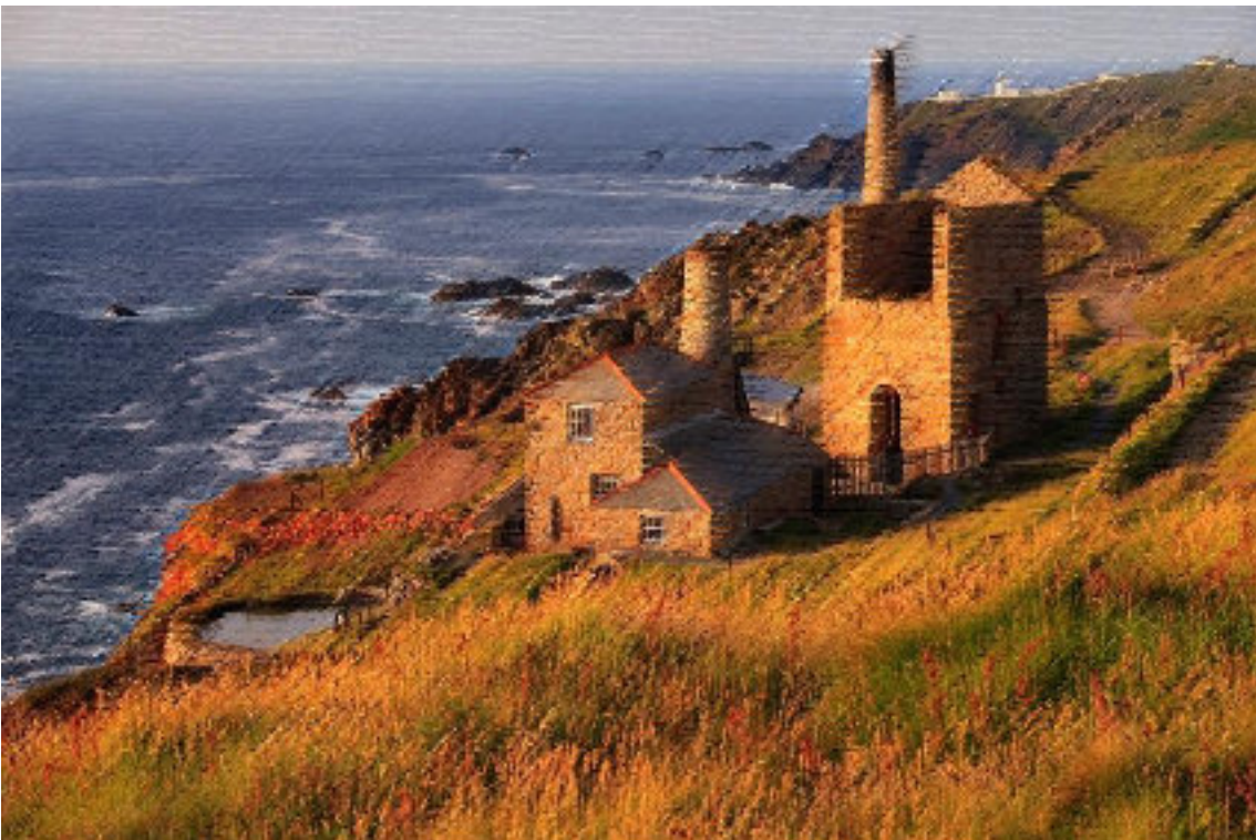
6 The Levant Mine and Beam Engine, St. Just