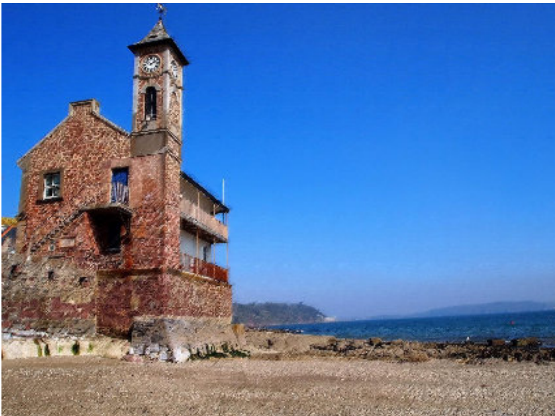
8 Kingsand Institute and Clock Tower, which was erected to commemorate the coronation of King George V