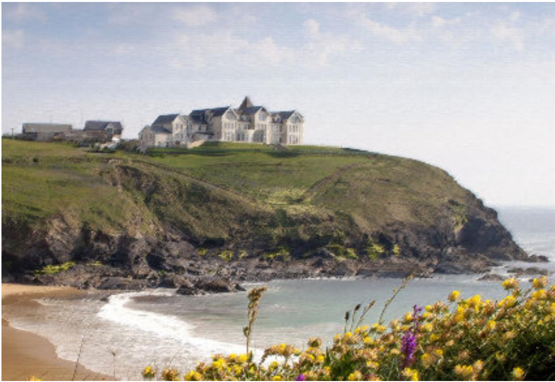
3 Land's End Hotel perched high up on the cliffs overlooking the Atlantic Ocean – Andy Caffrey