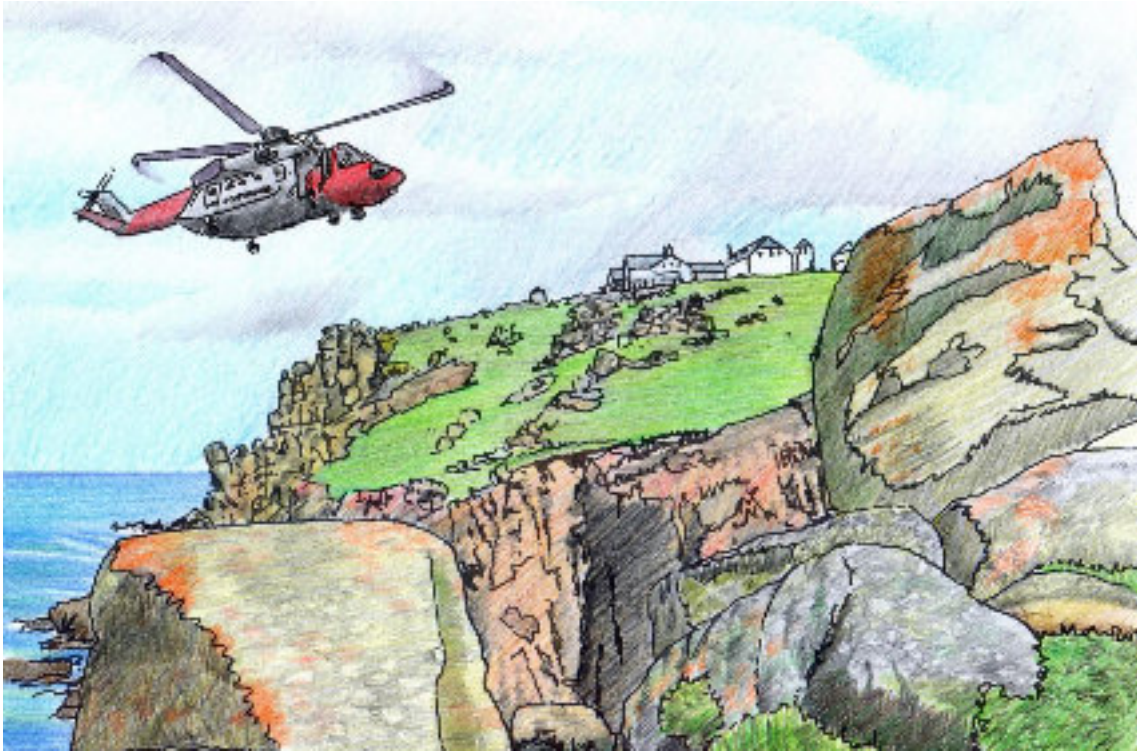
1 Land's End with a helicopter from HM Coastguard on manoeuvres