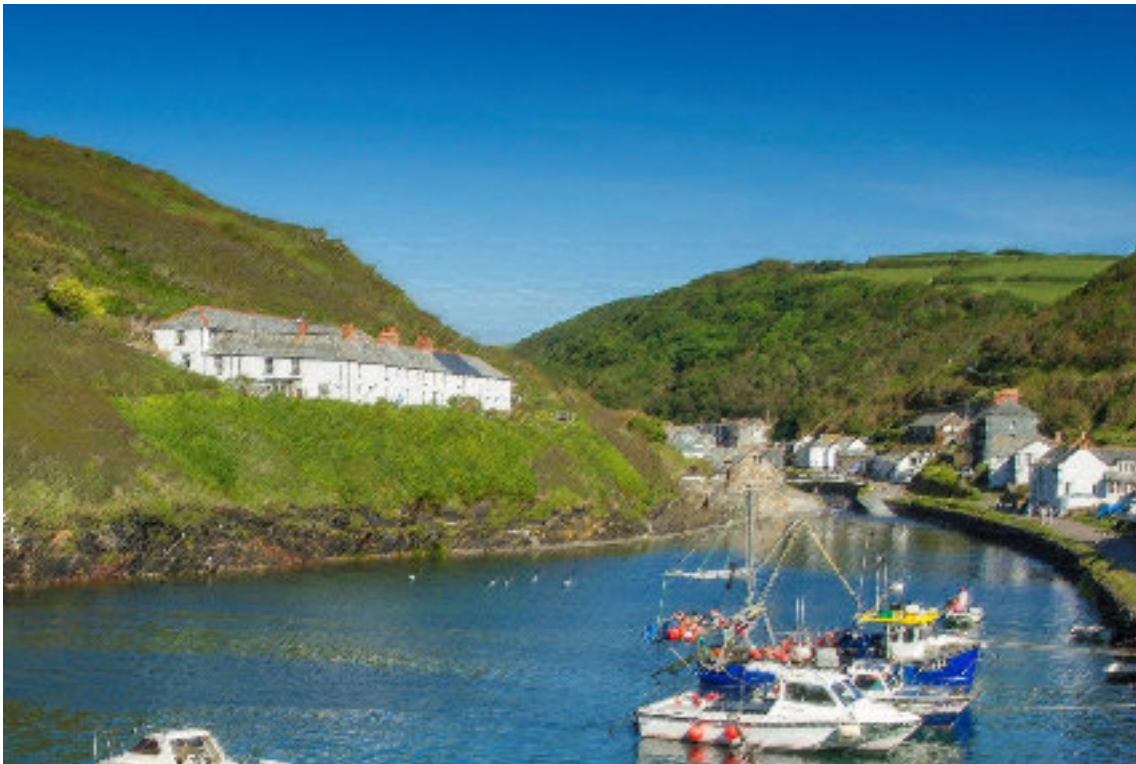
4 Looking up the estuary at Boscastle