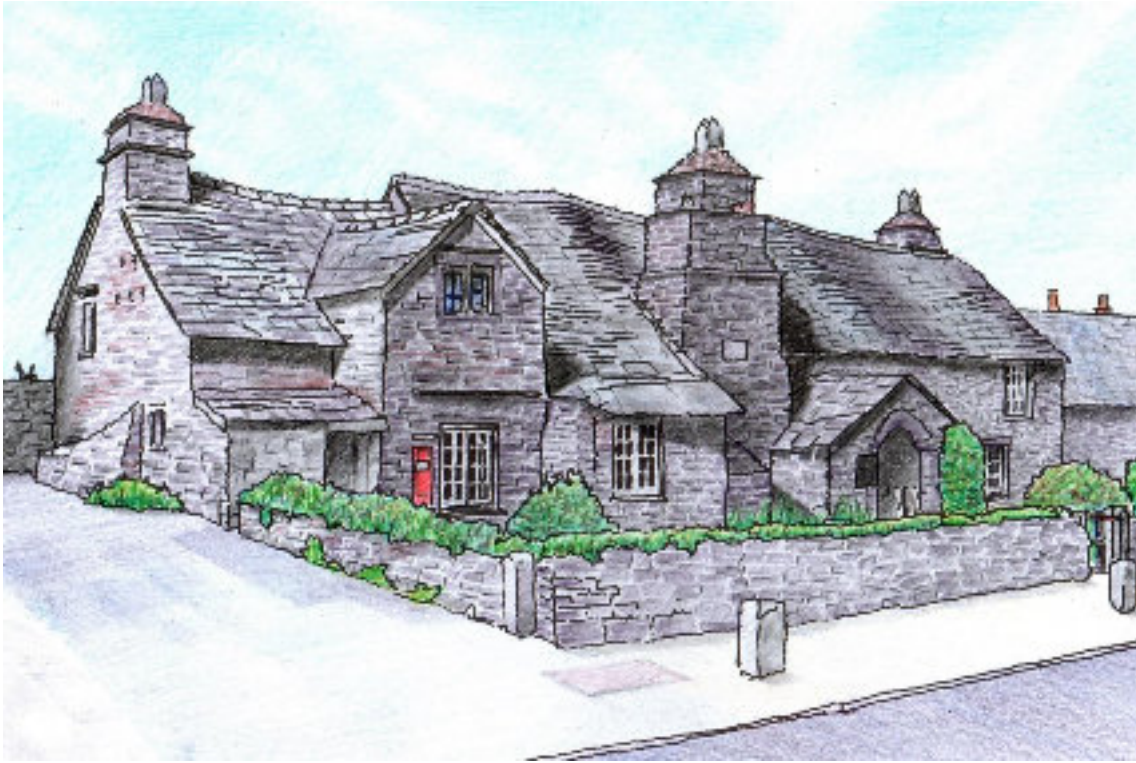
13 Tintagel Old Post Office is a 14th-century stone house