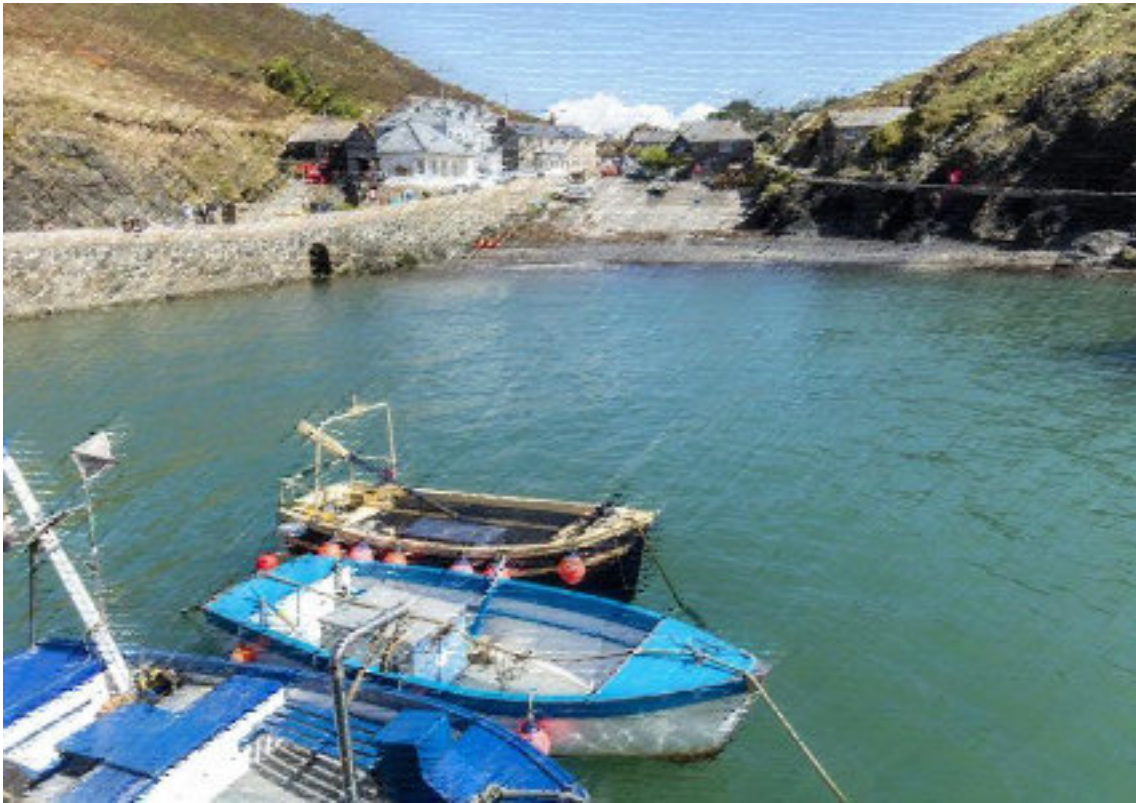
11 Mullion Cove lies on the south west coastal path in an Area of Outstanding Natural Beauty