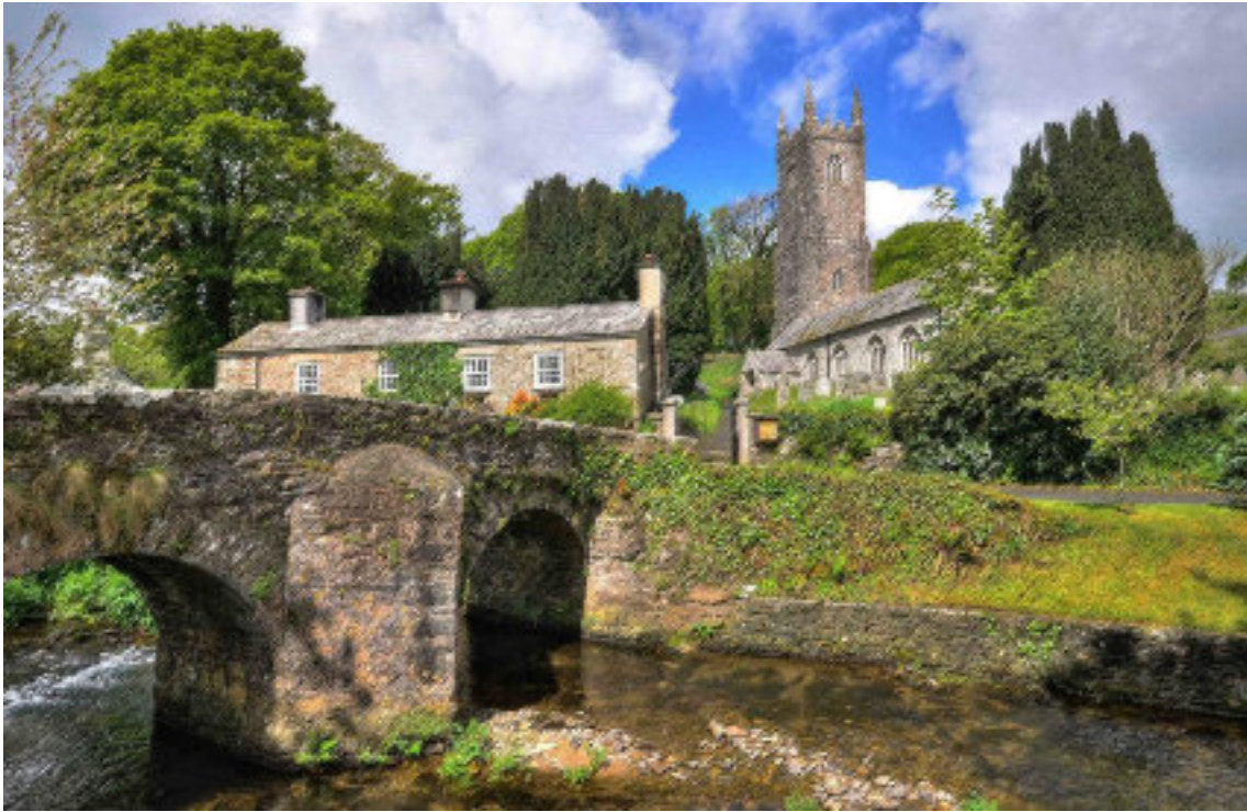
7 A view across the packhorse bridge at Altarnun on Bodmin Moor