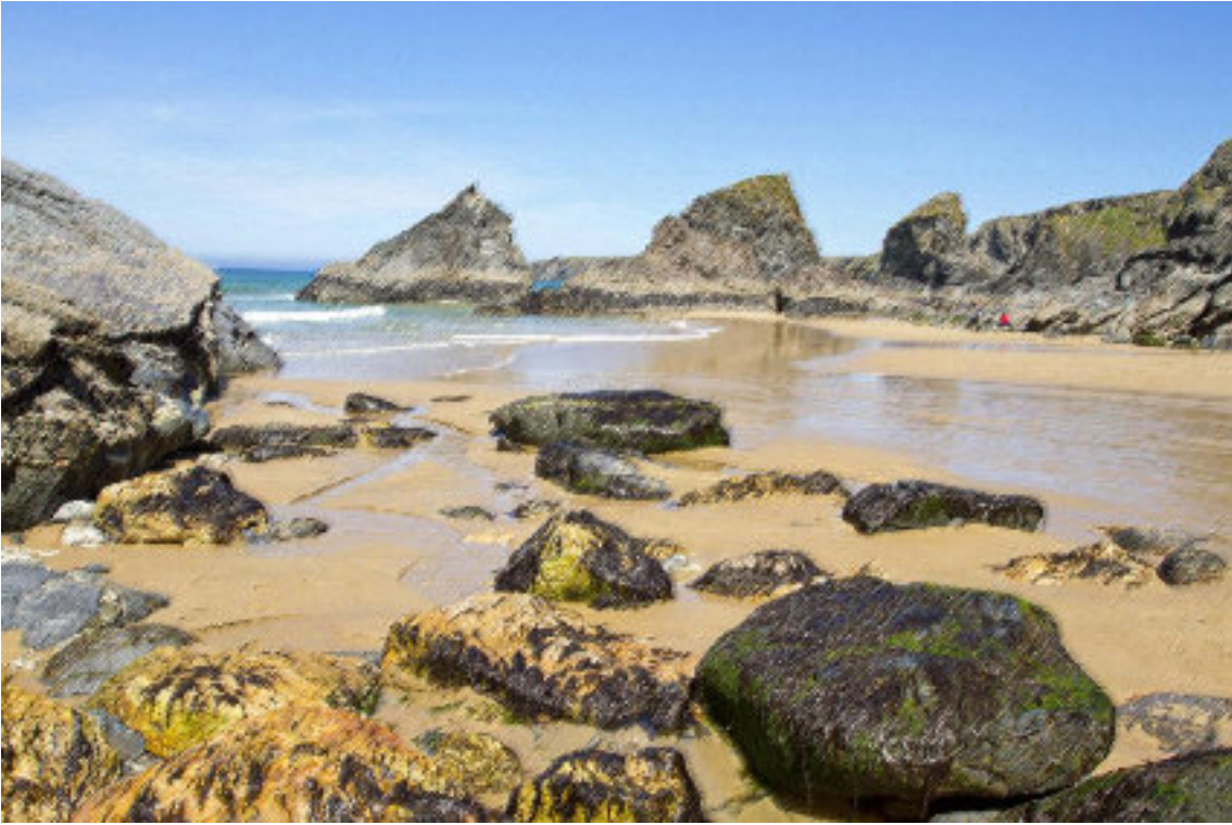
5 On the beach at Bedruthan Steps – Andy Caffrey