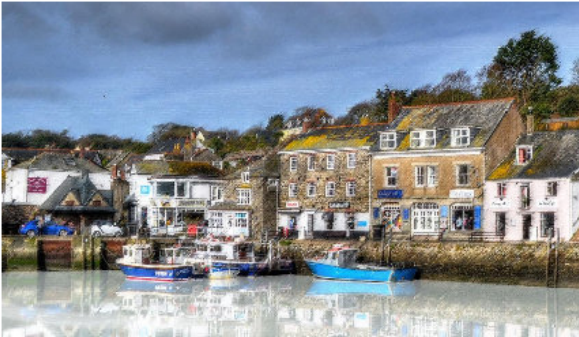
15 Fishing boats moored up in Padstow Harbour – Baz Richardson