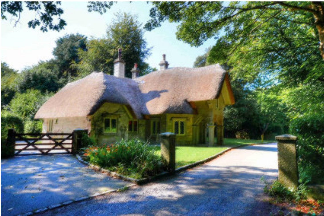
14 The Gate Lodge at Tehidy Country Park