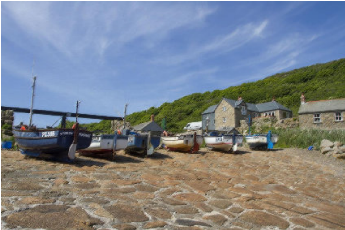
2 Small fishing boats pulled up in Pemberth Cove – Andy Caffrey