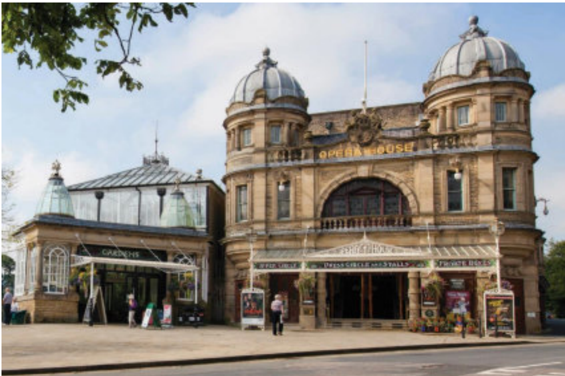
6 The impressive Opera House at Buxton