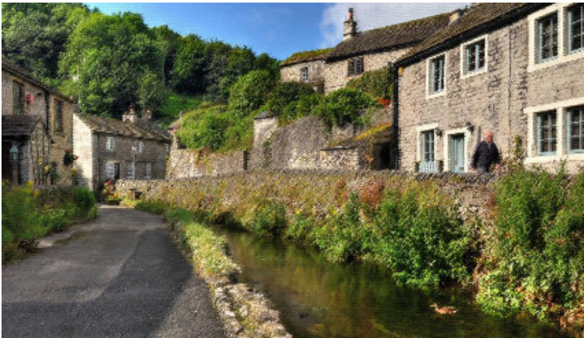
8 A view along Peakshole Water, heading to Peak Cavern in Castleton, famous for its Blue John Stone