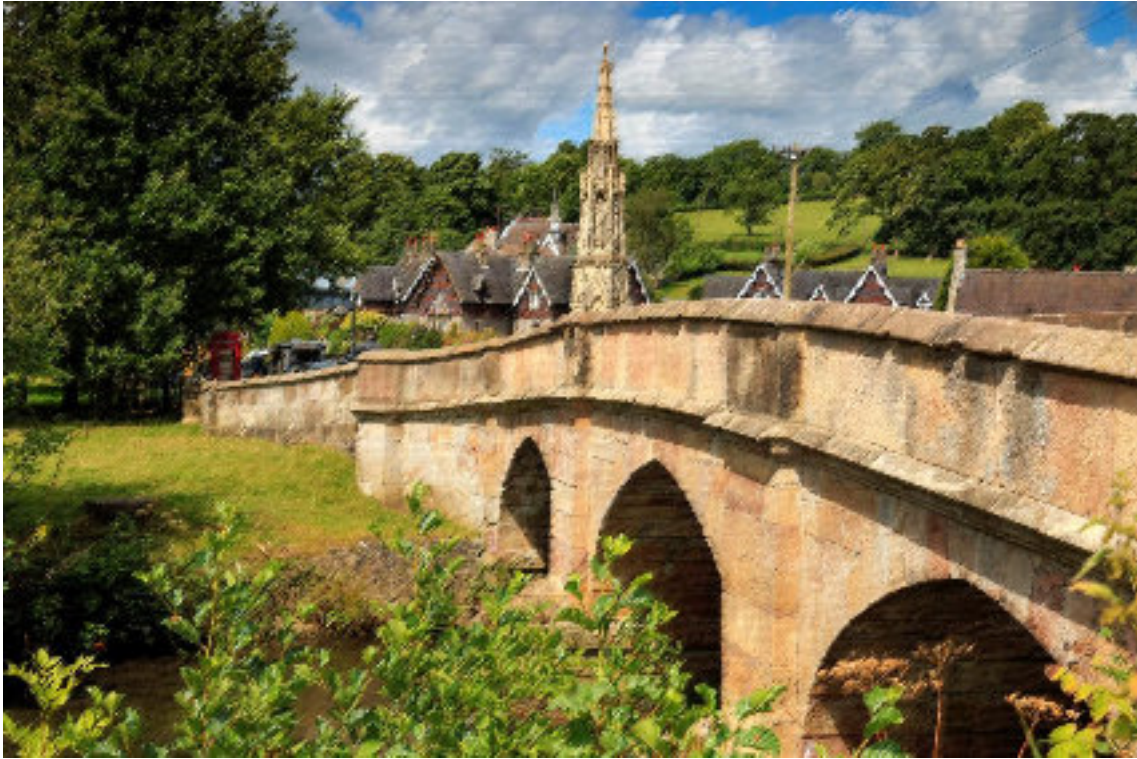
9 The pretty village of Ilam in the background and the bridge crossing the River Manifold – Andy Caffrey