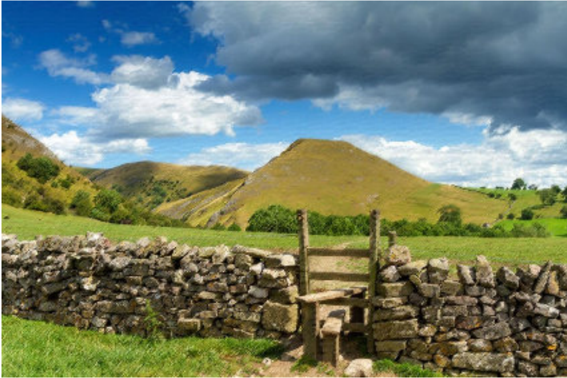
3 The flat top of Thorpe Cloud looms in the distance – Andy Caffrey