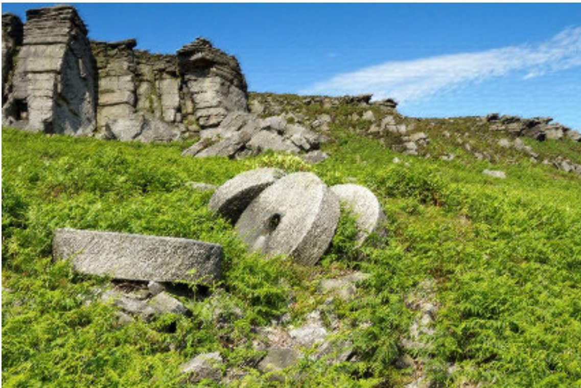
10 Abandoned Mill Stones at Hathersage