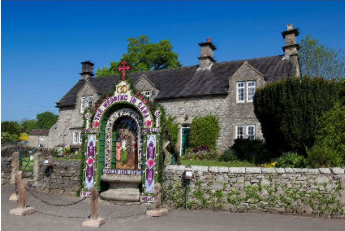
15 The traditional art of Well Dressing on display in Tissington – Mark Titterton