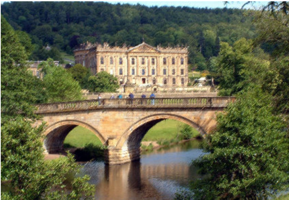
2 Chatsworth House from across the field with Paine's Bridge, in the foreground