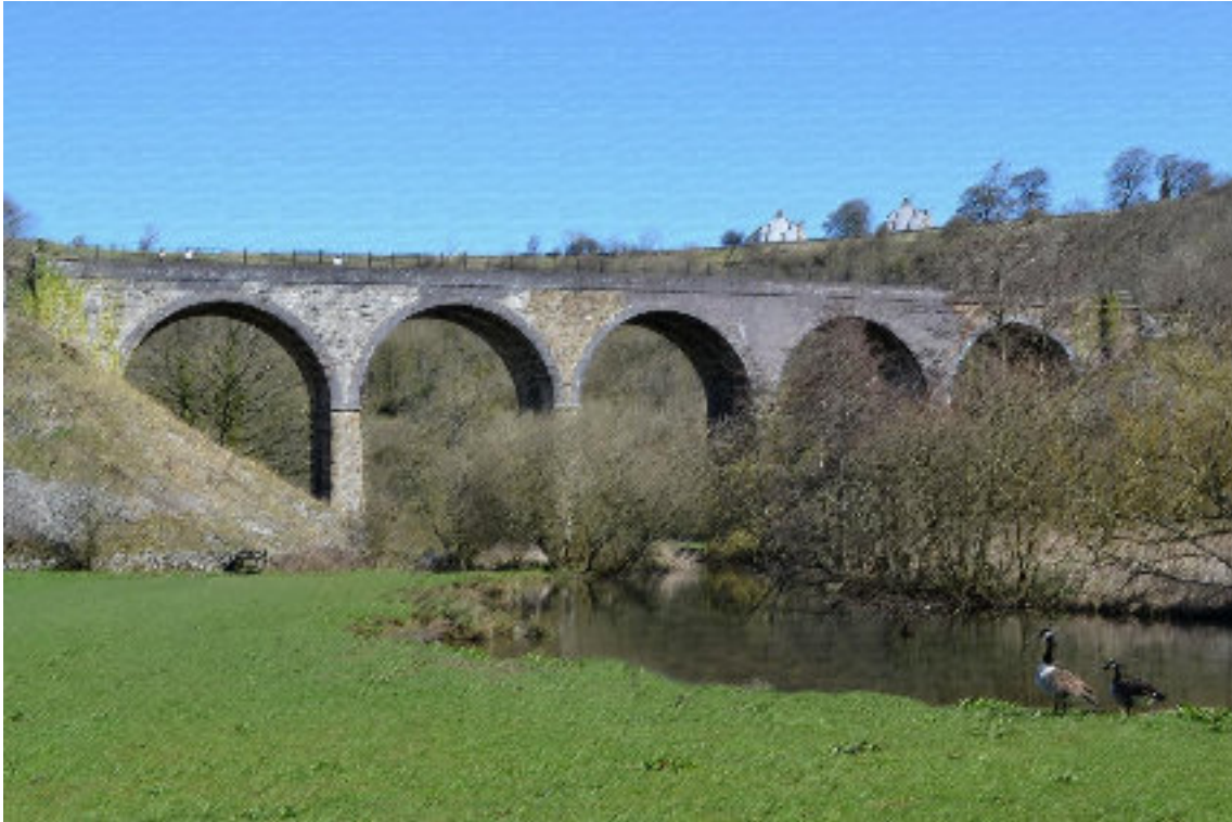
7 The five arches of the old railway bridge that spans the River Wye at Monsal