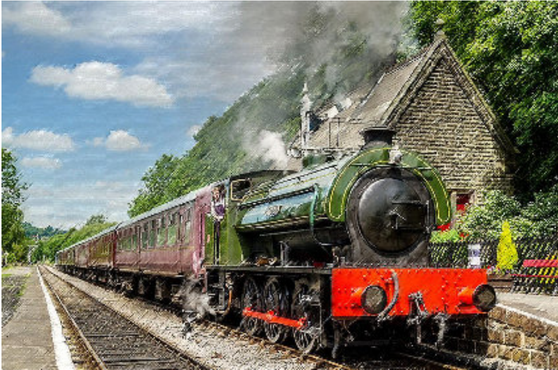
1 A train pulls out of Darley Dale Station on the Peak Rail Line