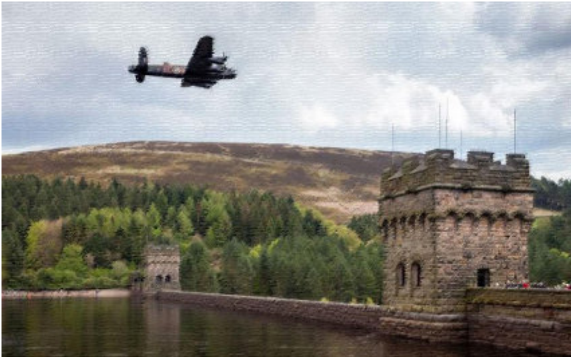
13 A Lancaster Bomber makes a low pass over the towers of the Derwent Dam as a tribute to the Dambusters from