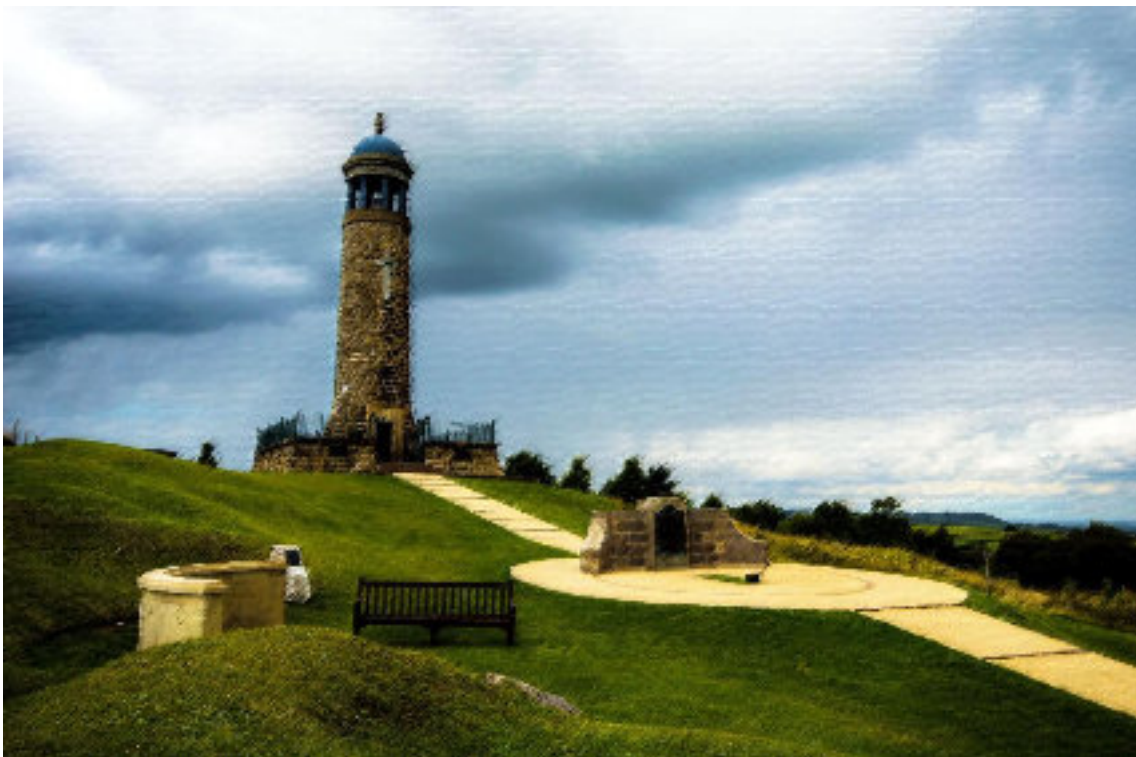
4 Crich Stand, a memorial to members of The Sherwood Foresters